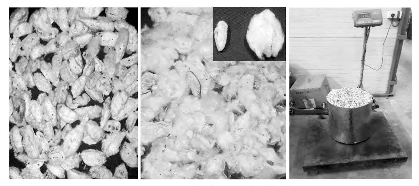
Fig. 2. Raw (left) and Opened (Centre) kawdi cotton and specific volume measurement

The performance of the machine was evaluated in terms of kawdi cotton handling capacity (kg/h), recovery (%) of ginnable seed