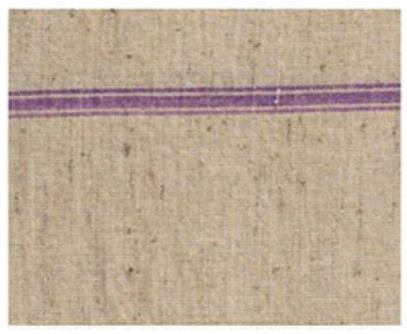
Fabric 2 : Plain weave fabric woven on power loom

Fabric count : Fabric count of Himalayan nettle-cotton union Fabric 1 and 2 was observed as 30 x 32 and 34 x 36, respectively (Table 1).